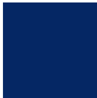
royal blue SUE-ROY