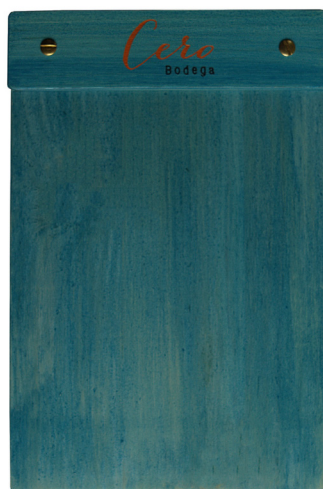
Baltic Birch with Blue Stain BAL-BLU